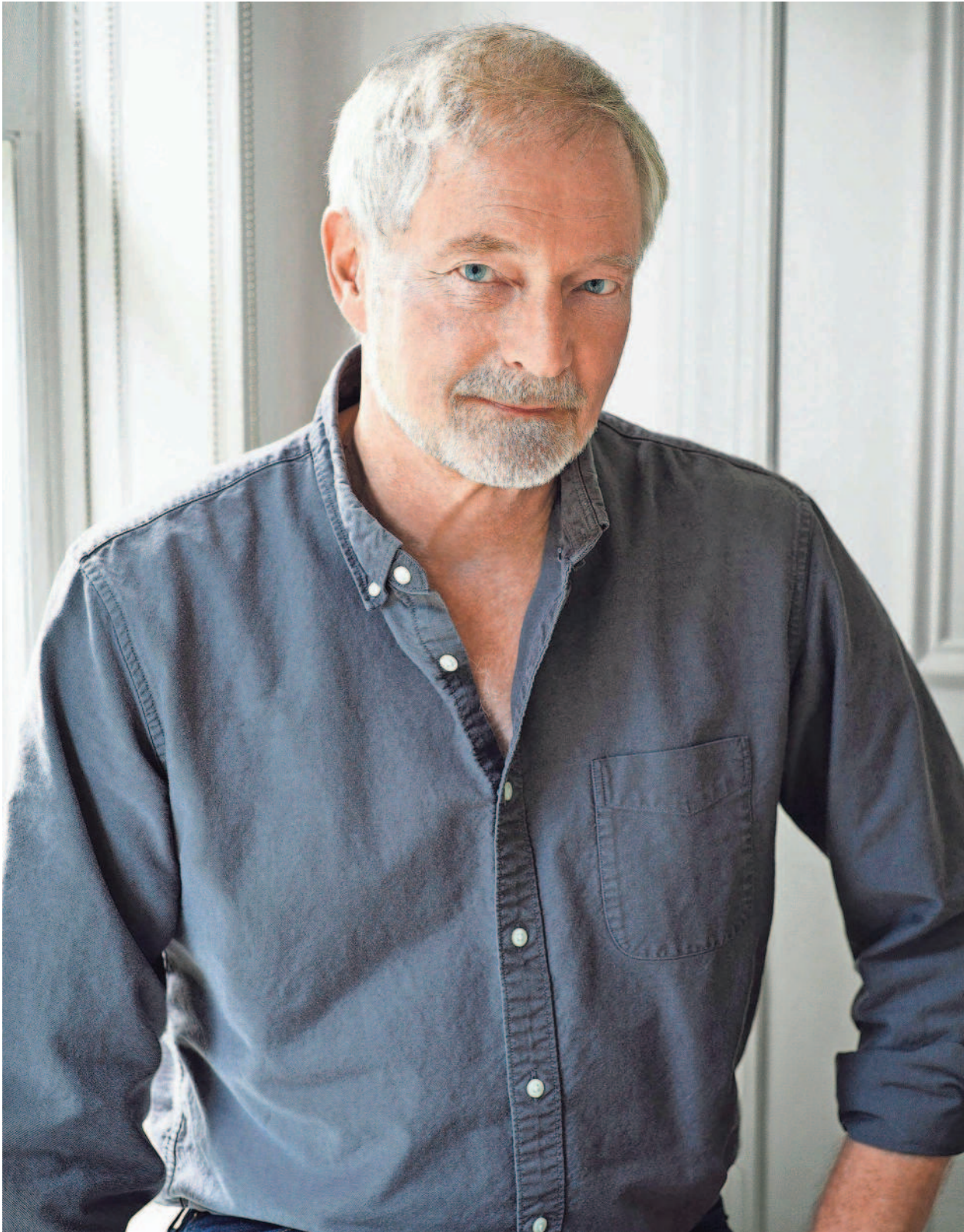
Erik Larson, author of "The Demon of Unrest," will speak in the Friends of the Library of Collier County Nonfiction Author Series on Monday, Feb. 24, at Hilton Naples.